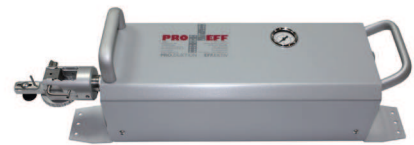
B: Pneumatic tension force