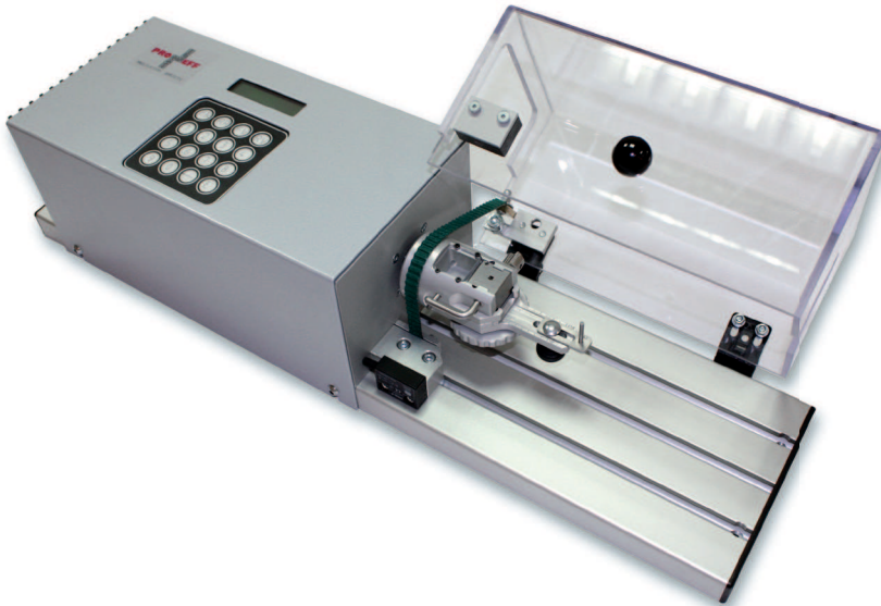
PRO Twist Basic A/B

TWISTING OF SINGLE STRANDS – NOW ALSO AVAILABLE WITH THE LATEST PNEUMATIC TENSION FORCE AND STRAIN RELIEF