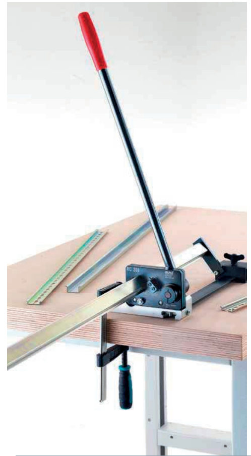
Cutter RC 200

Note: we recommend to send samples with the application requirements for a preliminary examination.