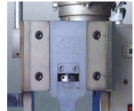
Adjustable crimping height