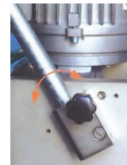
Terminal reel holder